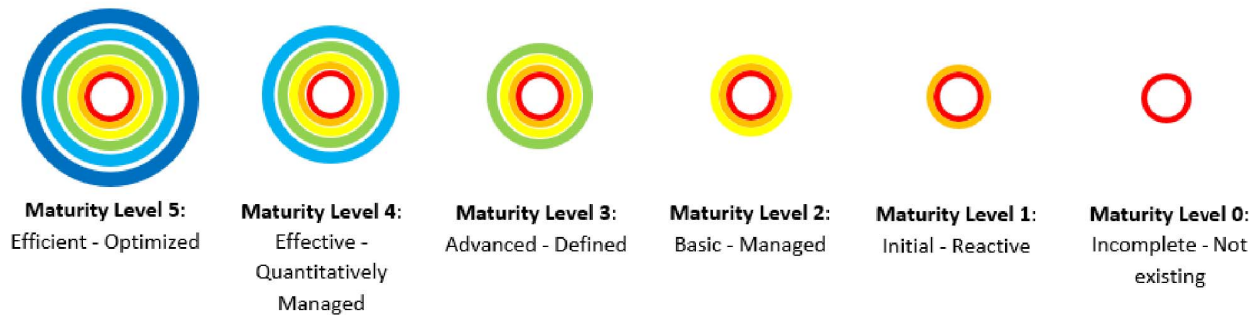
Figure 1. Maturity level representation: For each level of the maturity scale, a different seal was selected. Each seal represents a series of concentric cycles. The color of each cycle has been selected from the PH scale – red being the lowest and blue being the highest.

are implemented, measured, and controlled at the described level.