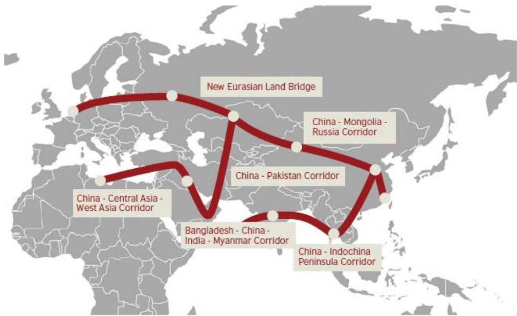
Figure 1. The Six Economic Corridors that Connect China with the rest of the world.